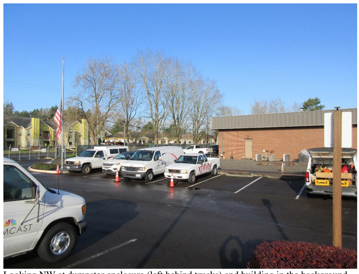
Looking NW at dumpster enclosure (left behind trucks) and building in the background.