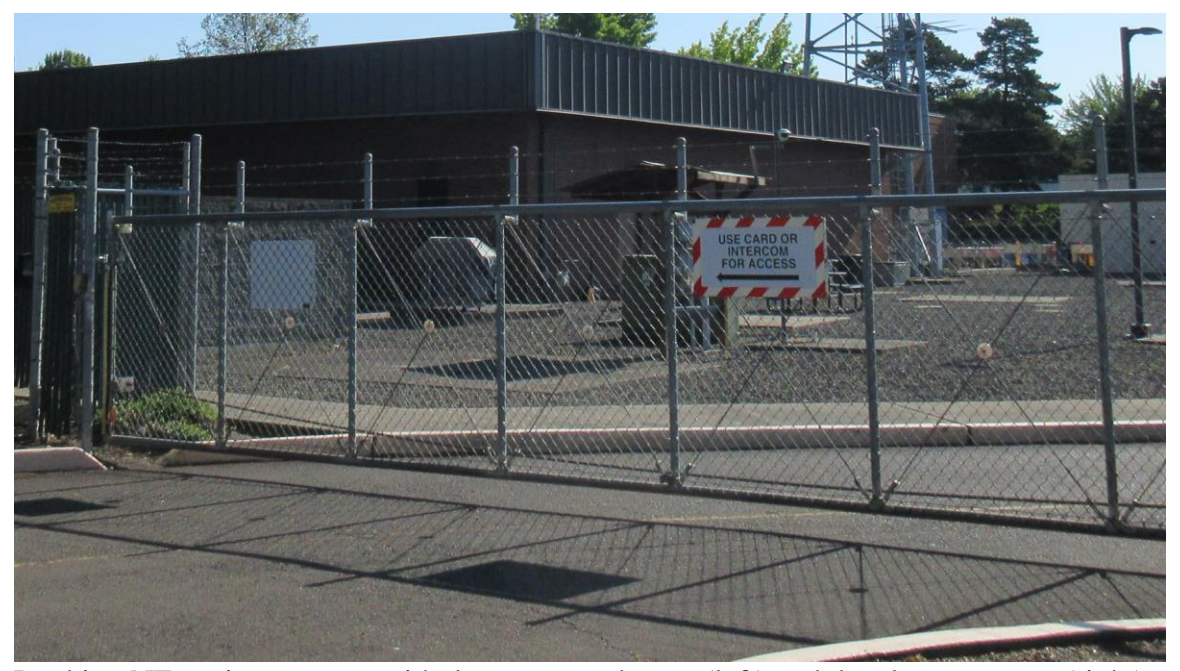
Looking NE at site entrance with dumpster enclosure (left) and development area (right).