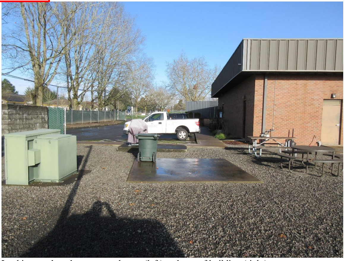
Looking north at dumpster enclosure (left) and part of building (right).