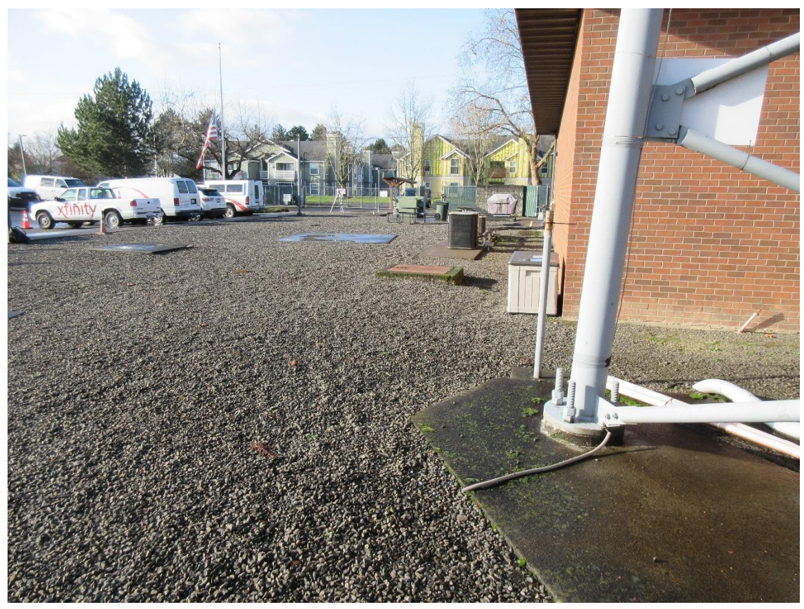
Looking west at existing gravel area for replacement generator units.